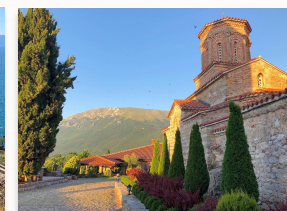
Saint Naum Monastery at Crm Drim