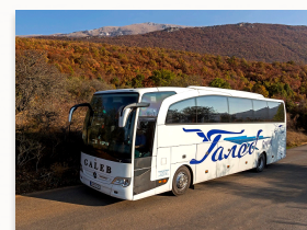
Taxi cars are readily available but so is public transportation

Ohrid City can be explored on foot if you wish to visit only the city center and St. John Kaneo and Old Town. However, we strongly recommend that you grab a taxi that can take you to St. Naum at Crm Drim for about $15. It's a 40 minute ride but oh so worth it. Taxi is safe and it should not cost you more than $3-$20 to get around the major destinations. To view google maps directions of main attractions in Kriva Palanka, click here .