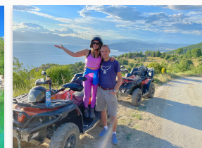
Hike to Galicica National Park to see Lake Ohrid & Prespa