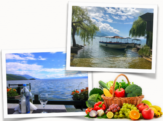
Fractured: Restaurants by Lake Ohrid with lake views. Macedonian Food ( watch this video ).