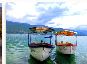
Water taxi is common and my favorite way of getting around